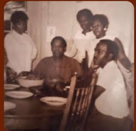
DANIELS SIBLINGS, MOBILE, ALABAMA ANCESTRAL GATHERING