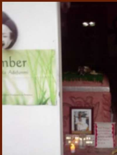
Crypt of Oyotunji village HRH Osejiman I