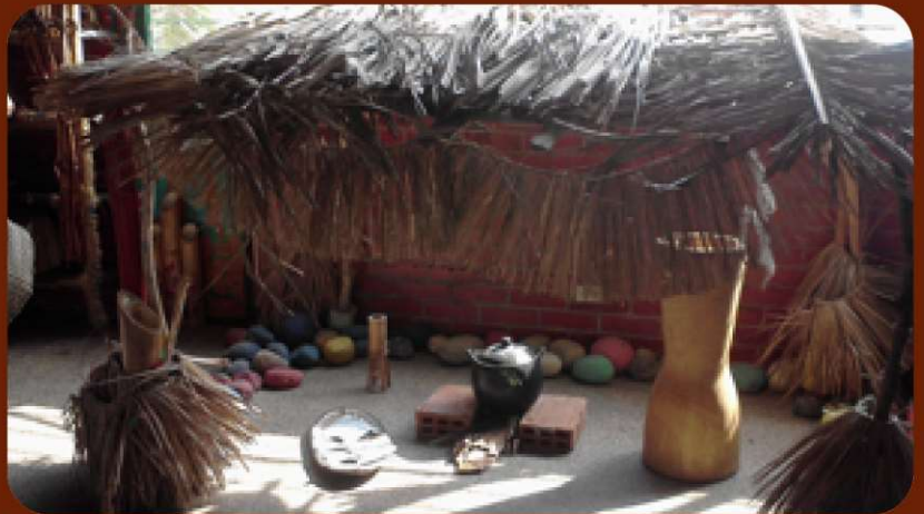
MLK, Jr. School, Children's Village, Cali, Colombia, SA

In the African Diaspora, there are many rich traditions that elevate and venerate the spirits of our ancestors. One of the most important of these traditions is the gathering of those who are powerful to speak in unison to call the ancestors, to witness their lives well lived. In doing this we acknowledge to them and others that we remember them, we call their names, we speak of them in the community and keep them forever in our hearts.