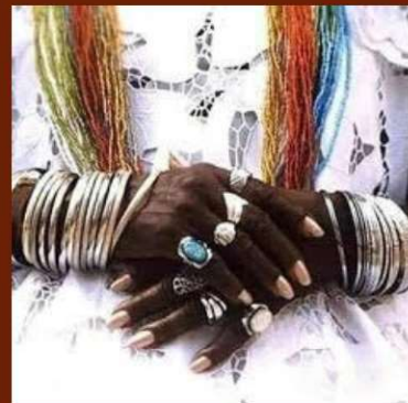
HONORING THE POWER OF THE SISTERS OF BOA MORTE CACHOEIRA, BAHIA, BRAZIL

Each day an elder will share with participants actions that can be done for your beloveds. Elders from cultural traditions around the globe will pray together each day for nine days. Registered participants will receive information about the rituals and activities presented during the nine days.