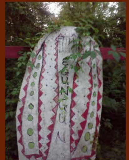
EGUNGUN cover (Oyotunji village photo)