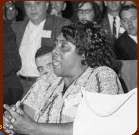
PICTURE: FANNIE LOU HAMER

HELPED HUNDREDS OF BLACK CITIZENS IN 1960S MISSISSIPPI WHO HAD BEEN DENIED THE RIGHT TO VOTE TO REGISTER.